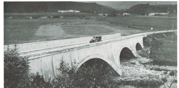
Spey Bridge, Schottland, 1926