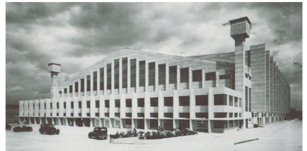
Empire Pool, London, 1934