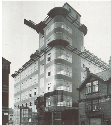
Daily Express Building, Manchester, 1939