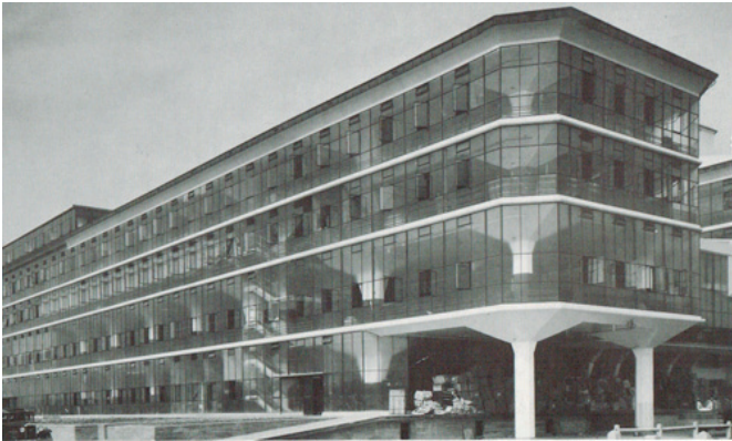
Boots Factory, Nottingham, 1930