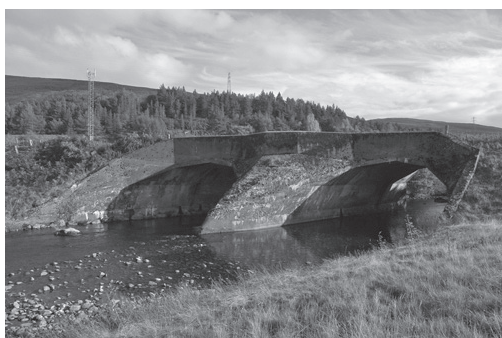
Crubenmore Bridge, Schottland, 1926