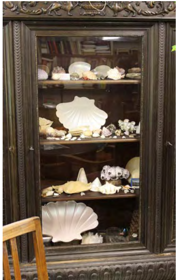
Figure 2: Isler's collection of shells

creations (Figure 2). In these natural forms, he saw “stiffened shells, double-curved shells, rotation shells, flawlessly formed shells in countless variations, wafer-thin and still resistant.” [5, p. 52]. In Isler's perception of natural forms in general, the shell constituted the dominant principle. According to Isler, the shell's shape is always optimal: “It is natural law, and therefore also the most ecological form in the universe.” [5, p. 54].