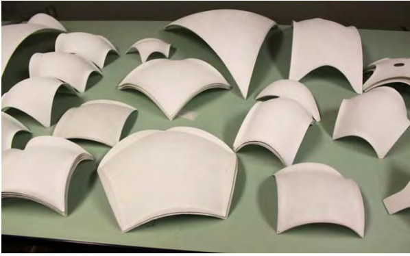
Figure 1: Study of shell forms at Isler's office

In general, Swiss architecture to this day is strongly influenced by a tradition of craftsmanship and construction in which precision and the appropriate consumption of materials were also always signs of efficient resource management. This specific form of efficiency also shapes the infrastructure of the country with civil engineering constructions such as bridges and tunnels. Examples of this understanding of efficiency are buildings of engineers such as Robert Maillart or Christian Menn – in their works the static necessity develops a formative power and as such reveals itself in the problem of loading and bearing as a form of architectural expression.