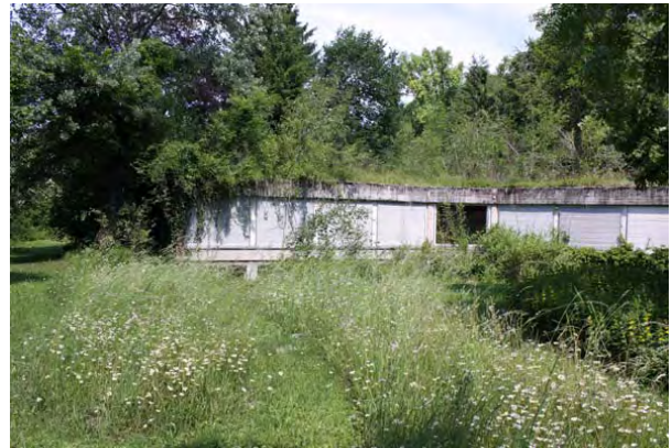
Figure 3: Isler’s office, Spring 2011

inseparable static logic on the one hand and the aspect of economics and pragmatic rules of production on the other; the coming together of these two generates a concise form of expression [7, p. 56-62]. As a result of his study of gothic architecture of the 12th century, Violett-le-Duc deduced that architecture must express the interdependence with nature; by way of a dialogue between form and forces, architecture must demonstrate the way in which it resists the effects of gravity. In this context, Isler’s experimental, physical methods of form-finding act as a sort of response to Violett-le-Duc’s demand.