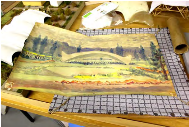
Figure 5: Water color drawing of shell by Isler

The contradictory impression is further reinforced by the deep division between interior and exterior space produced by the pragmatically placed planar windowfront along the shells' edges. This defines a precise border which not only interrupts the spatial flow, but also, as a result of the change in the language of forms, is perceived as a foreign body. The same is true for the entrance situation, which normally does not develop in a self-evident or inherent way from the shape, but rather must be added on as an artificial element. Hence, in Isler's projects the spatial transition between inside and outside often constitutes a place of breakage; spatially, the building seems to be added on, rather than integrated. This is also true because the shell shape generated is understood by Isler as a pure, unchangeable form and expression of natural laws. For this reason, it experiences no later adaptation to the circumstances of the real place of construction.